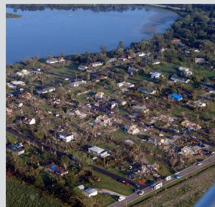
Stoughton Tornado 18 Aug 2005

Five weak (F0, F1) tornadoes were reported across east central Wisconsin from Wautoma to near Manitowoc during the early to midevening. These tornadoes were on the ground for less than ten minutes and had a path length of no more than four miles. Most of the damage was to trees, farm buildings and equipment. Torrential rains accompanying the tornadic thunderstorms caused minor flooding near Green Bay and Manitowoc.