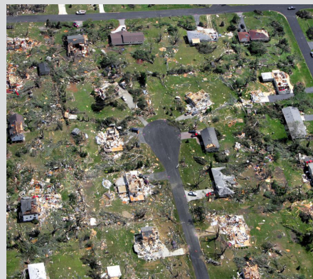
Stoughton Tornado 18 Aug 2005

Jefferson County, after remaining on the ground for 53 minutes and traveling nearly 19 miles. The updraft from the tornadic thunderstorm carried debris as far east as lakeshore communities near Milwaukee. In addition to the F3 tornado, the parent supercell also spawned seven weak tornadoes in Dane and Jefferson Counties, produced up to golf ball size hail (1.75 inches in diameter) and generated straight-line thunderstorm winds reaching 75-mph.