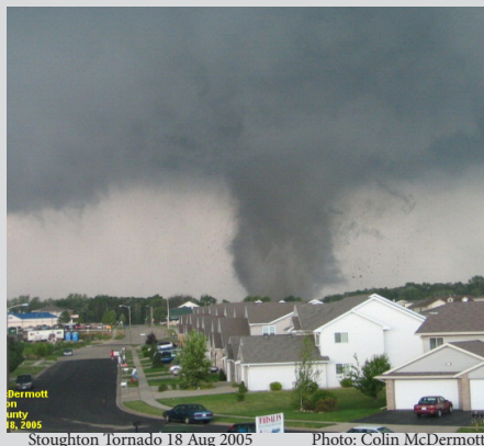
Stoughton Tornado 18 Aug 2005

The advancing cold front provided the lifting mechanism to help generate the tornadic thunderstorms. A line of thunderstorms had developed during the afternoon over northeastern Iowa and southeastern Minnesota ahead of the eastward moving cold front. Reaching southwestern Wisconsin, the first supercell resulted in the formation of nine weak tornadoes in Vernon and Richland Counties, followed by one F2 tornado that injured 2 people near Viola (Richland County) and another F2 tornado in Sauk and Columbia Counties.